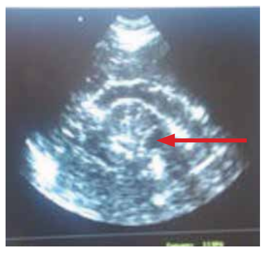
FIGURE 3 Sonogram of a Renal Cyst (arrow)