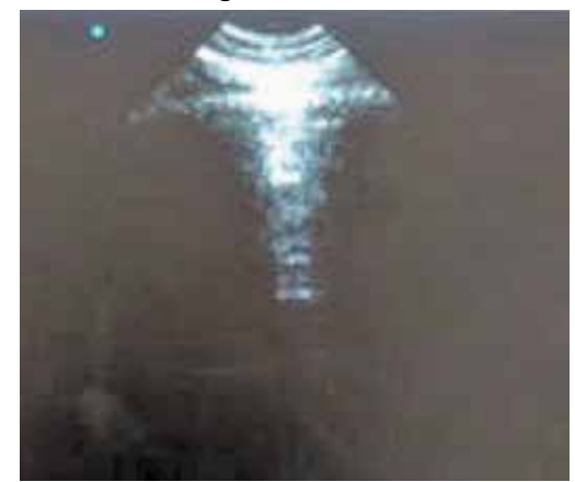
B lines (also known as comet or rocket tails) were absent in all lung fields imaged.

detection of the intra-abdominal hypertension was only 67.5% when the surface area of the IVC was < 1 \text{ cm}^2/\text{m}^2 .<sup>31</sup>