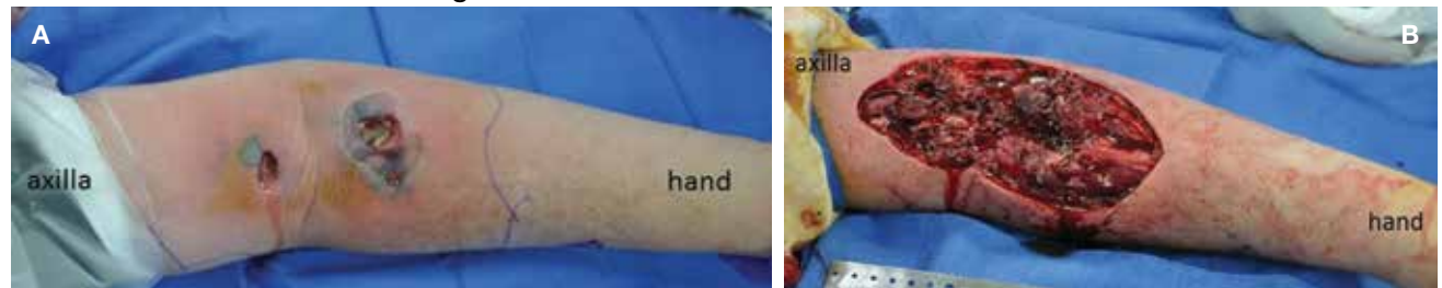
A, preoperative; B, postoperative.

FIGURE 3 Patient 4 Necrotizing Infection of the Upper Extremity