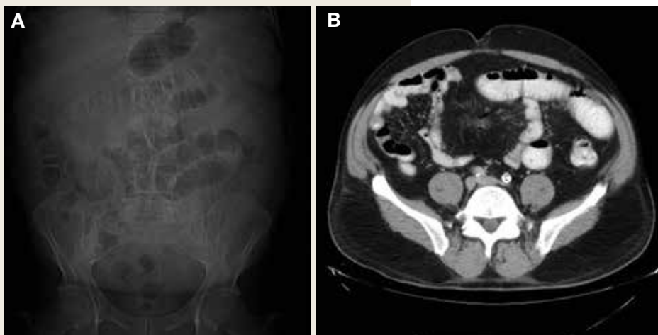
(A) Abdominal X-ray; and (B) abdominal/pelvis computed tomography, showing dilated loops of proximal small bowel, mild midileum focal wall thickening, and narrowing of distal small bowel.