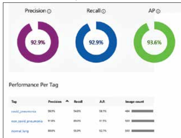
FIGURE 2 Trained Machine Learning Model Performance Example

tations to the routine use of CT scans with conditions such as COVID-19. Aside from the more considerable time required to obtain CTs, there are issues with contamination of CT suites, sometimes requiring a dedicated COVID-19 CT scanner. 23,28 The time constraints of decontamination or limited utilization of CT suites can delay or disrupt services for patients with and without COVID-19. Because of these factors, CXR may be a better resource to minimize the risk of infection to other patients. Also, accurate assessment of abnormalities on CXR for COVID-19 may identify patients in whom the CXR was performed for other purposes. 23 CXR is more readily available than CT, especially in more remote or underdeveloped areas. 28 Finally, as with CT, CXR abnormalities are reported to have appeared before RT-PCR tests became positive for a minority of patients. 23