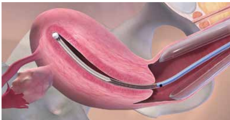
FIGURE 4 Endometrial brush sampling.