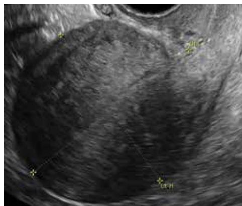
FIGURE 1 Sagittal view of anterior uterus with hyperechoic changes extending anteriorly and posteriorly from the endometrial echo, suggesting adenomyosis.