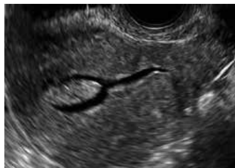
FIGURE 5 Sagittal view of uterus with endometrial cavity distended by saline (sonohysterogram or saline-infusion sonogram), demonstrating fundal endometrial polyp.