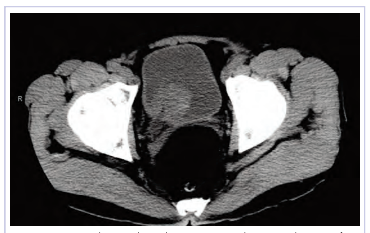
FIGURE 1 Pre-neoadjuvant chemotherapy computed tomography scan of bladder tumor. Moderate-sized focal heterogeneous soft tissue mass density in right posterior bladder about 3 cm in size.

The patient continued to deteriorate rapidly, with a progressive leukocytosis, and developing metastases to the lung, perineum, and penis. He died a month after surgery (2 months after completion of neoadjuvant chemotherapy). The leukocytosis exhibited in this patient and the aggressive tumor cell growth are believed to have been secondary to a paraneoplastic leukemoid reaction incited by the urothelial bladder cancer cells' presumed production of G-CSF, which has been rarely reported in the literature previously.