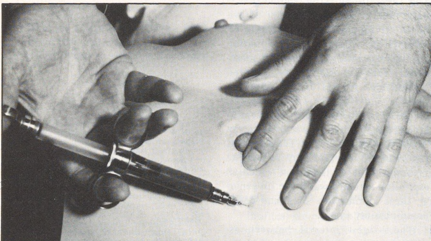
Figure 4. Fluid is aspirated from the cyst with the help of digital pressure.

One special circumstance which should be mentioned is when grossly bloody fluid is returned with aspiration. If the blood is from the center of a necrotic tumor, aspiration will not cause disappearance of the mass. If the mass completely disappears, the patient is still regarded with more suspicion because of the possibility of a papilloma or, even more rarely, a small