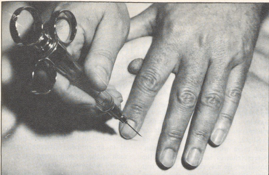
Figure 3. While the cyst is immobilized between the index and middle fingers, puncture into the cyst is accomplished.

palpation, our tendency is to include mammography as part of breast examination.