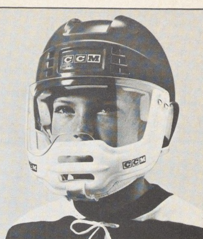
Figures 2 and 3. Full face protection by CCM** mounted on two different helmet styles. The top part is clear plastic. The company recommends that both parts be worn together although each is a separate unit. This type of facial protection will prevent injuries from sticks, pucks, and skates. Both this type of protective equipment and the wire mask are designed to fit any brand of helmet.

have complained of respiratory restriction by the lower face guard.