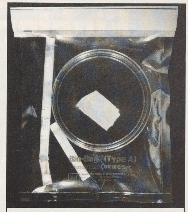
Figure 3. Commercial anaerobic bag system for transportation of tissue or other specimens

A. Spencer CD, Beaty HN: Complications of trans-tracheal aspiration. N Engl J Med 286:304, 1972 5. Dowell VR Jr: Anaerobic infections. In Bodily HL,