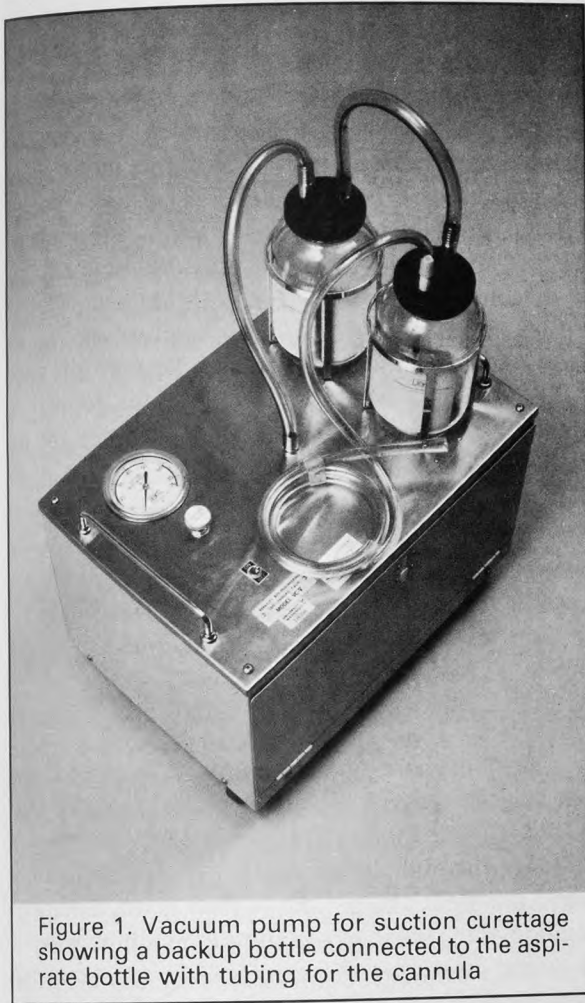
Figure 1. Vacuum pump for suction curettage showing a backup bottle connected to the aspirate bottle with tubing for the cannula