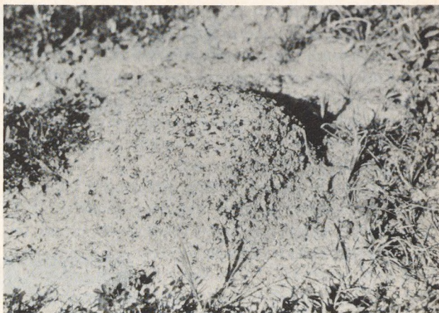
Figure 3. A fire ant mound.

colony, many of which are fertile, thus increasing the colony's resistance to natural threats and pesticides. 9