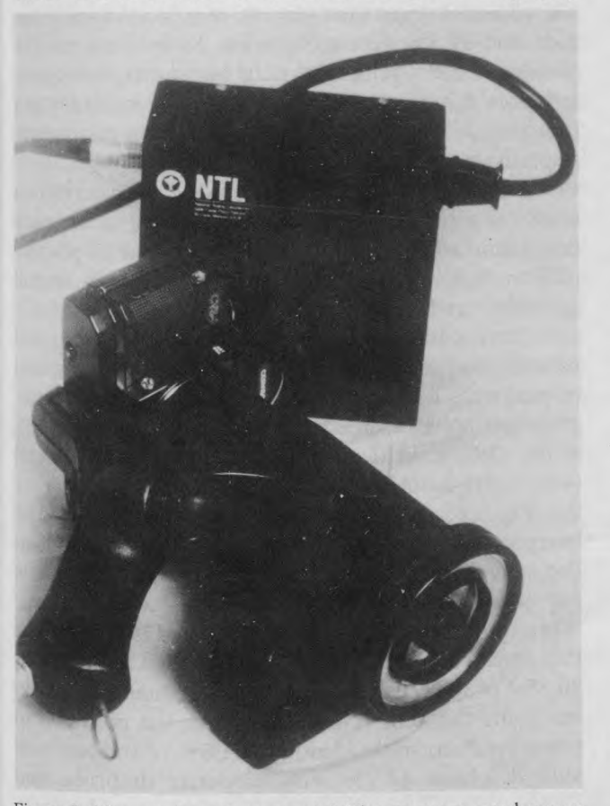
Figure 1. The cerviscope, or special 35-mm camera and power unit designed for cervicography.

Cervicography (National Testing Laboratories, Fenton, Mo) is a relatively new adjunct method of cervical cancer screening intended to complement cervical cytologic sampling. Cervicography may be described as the process of producing and interpreting a simple static ectocervical photographic image of the cervix, the evaluation of which is based on colposcopic principles. Cervicography is not colposcopic screening<sup>10</sup> or colpophotography.<sup>12</sup> Cervicography combines features of these two items with a laboratory-based system of procedural and equipment standardization, results reporting, consultation, documentation, and quality control that is not unlike that for the Pap smear process. Whereas the Pap smear detects disease at a cellular level, cervicography