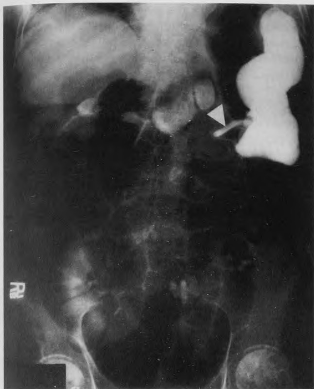
Figure 1. Radiographic study demonstrates filling of the colon rather than the stomach during instillation of Gastrografin. The PEG tube is indicated by the arrow.